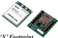
'X' Footprint (XF) Embedded Modems