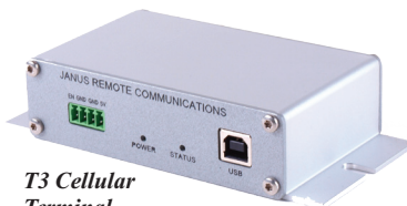
T3 Cellular Terminal