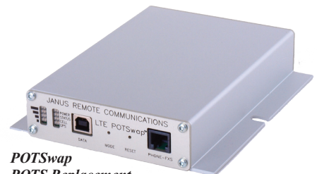
POTSwap POTS Replacement

We do IoT — From Idea Through Integration www.janus-rc.com