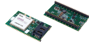
Common Footprint (CF) Embedded Modems