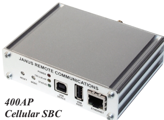
400AP Cellular SBC