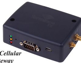
T2 Cellular Gateway